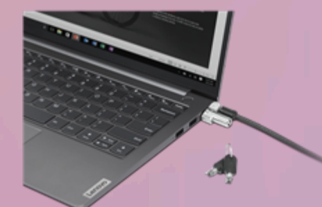
NanoSaver Cable Lock from Lenovo 4XE1L51710

Please click here to view the full list of accessories.