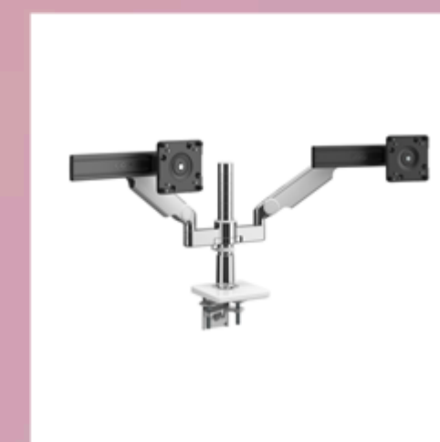
Humanscale Dual Monitor Arm White 4ZE1U10767